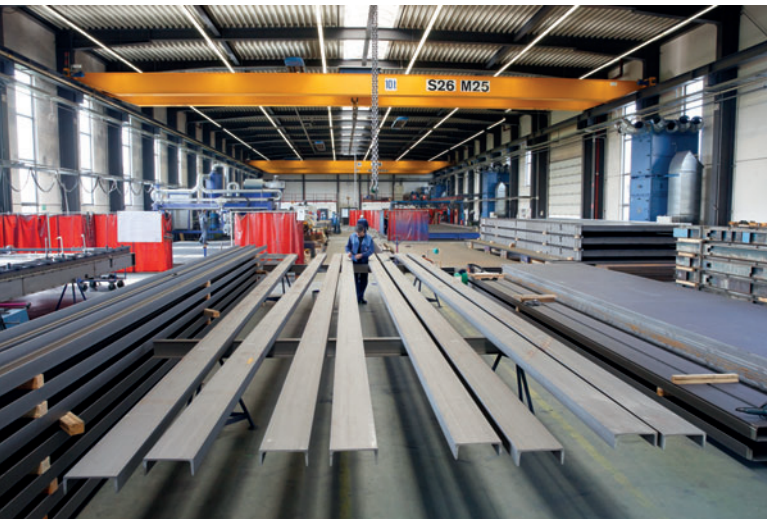
The construction of plants for the manufacture of precast concrete elements needs space: it must be around 3000 square metres here in Hall 8.

For instance, Weckenmann put the first concrete distributor for Omnia large floor slabs into series production in 1971, although it should be noted that the patent was held by a Weckenmann customer. However, the first 1:1 large-scale plotter for precast plants was an invention of the Dormettingen com-