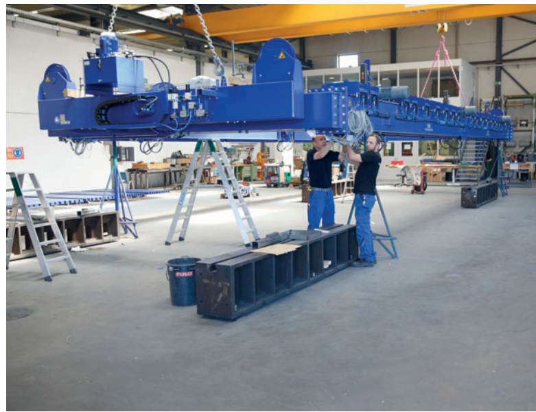
Cabling of a turnover spreader beam, which the user employs for the production of double walls.

The first shuttering robot for the automated handling of the gigantic shuttering profiles came along in 1992. That is still a Weckenmann speciality today. Weckenmann is one of the leading suppliers in particular in the shuttering robot segment. At some customers, for instance, the patented Twin-Z shuttering robot provides for around a 30 percent cycle time reduction in comparison with a conventional shuttering robot. Thanks to the patented double-Z axis, even long and heavy shuttering profiles can be reliably positioned.