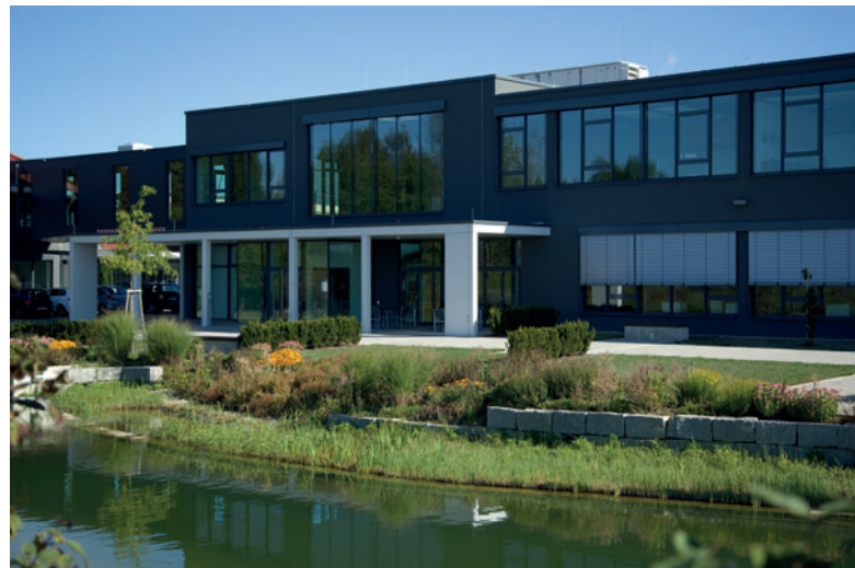
Aesthetic construction with precast concrete elements: development and sales centre at the headquarters in Dormettingen.

For instance, Weckenmann put the first concrete distributor for Omnia large floor slabs into series production in 1971, although it should be noted that the patent was held by a Weckenmann customer. However, the first 1:1 large-scale plotter for precast plants was an invention of the Dormettingen com-