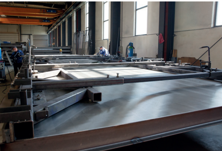
Formwork pallets from Weckenmann with their homogeneous shuttering surface can be up to 15 metres long and weigh 10 tonnes.