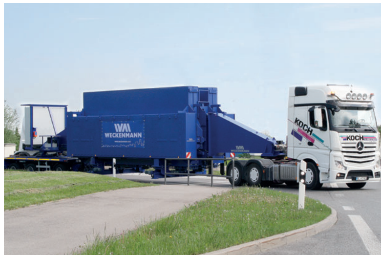
On the way to the customer: MBM® battery mould for the upright production of solid walls and floors.