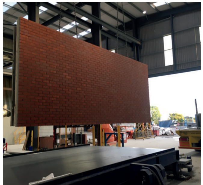
Manufactured precast concrete elements with bricks.