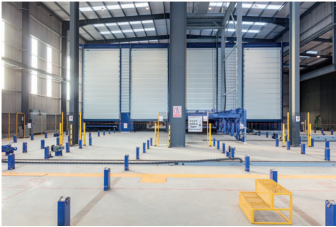
Storage and retrieval machine / curing chamber