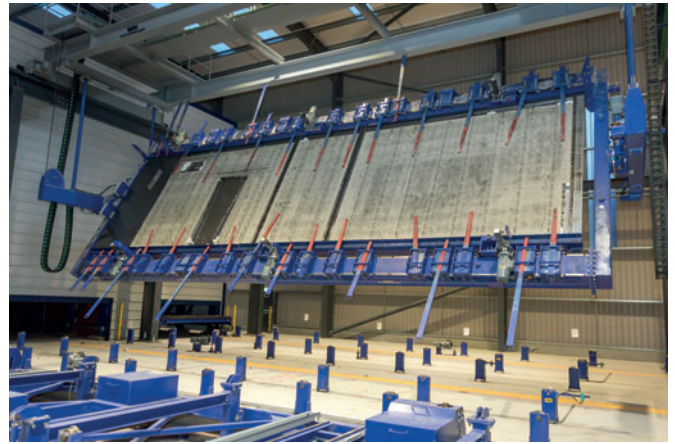
Pallet turning device

Facts about the new plant at Keegan Precast: