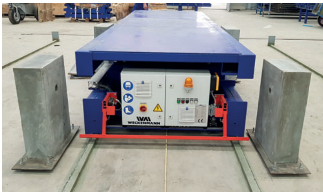
Run-off truck with hydraulic lifting platform for taking up the floor slab stacks

With a capacity of 2 m 3 concrete each, the two bucket conveyors commute back and forth between the mixing plant and the concrete spreaders. The bucket conveyor follows the concrete spreaders via a tracking controller so that the concrete can be transferred with a minimum loss of time. Con-