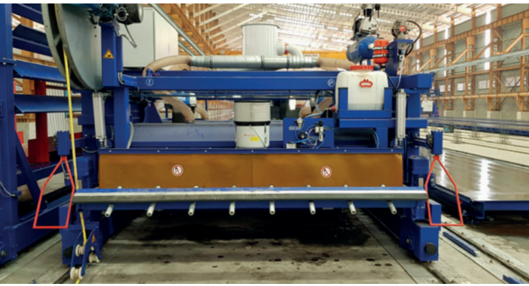
Cleaning and spraying system for release agent with tension bar for tensioning strands

tion lines with hydraulic detensioning cylinders on both sides of the production lines.