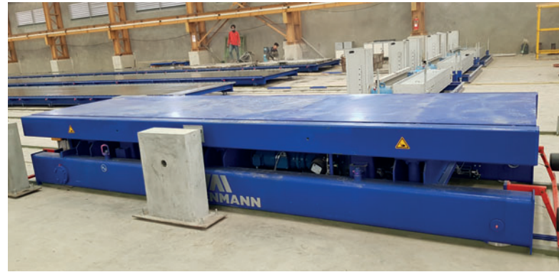
Run-off truck with hydraulic lifting platform for taking up the floor slab stacks