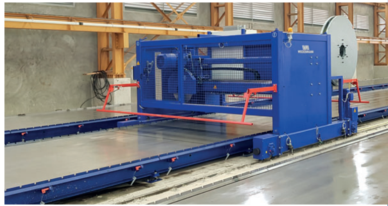
Tensioning strand saw

The transverse shutters are slotted for the continuous tensioning strands, over which they are placed. For the detensioning of the parts the transverse shutters are resilient so that they can absorb the detensioning pressure. After curing they are stripped by means of special spreader bars above the utility cart.