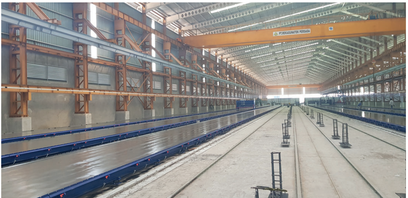
Six production lines arranged in parallel with a central logistics aisle.

The new floor slab manufacturing plant offers the possibility to manufacture prestressed solid slabs with a manufacturing width of maximally 2,400 mm. The production lines offer the possibility to manufacture surfaces in fair-faced concrete quality. The formwork surfaces are precisely even and finely polished by machine.