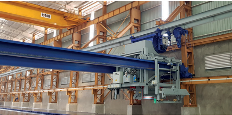
Half-gantry concrete spreader with bucket conveyor during concrete transfer

The prestressing unit for the tensioning of the tensioning strands consists of tensioning abutments integrated into the building foundations on both sides at the ends of the produc-