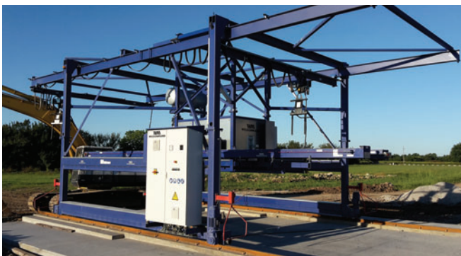
General view of the machine

Weckenmann Anlagentechnik GmbH+Co.KG Birkenstraße 1 72358 Dormettingen, Germany T +49 7427 94930 F +49 7427 949329 info@weckenmann.de www.weckenmann.com