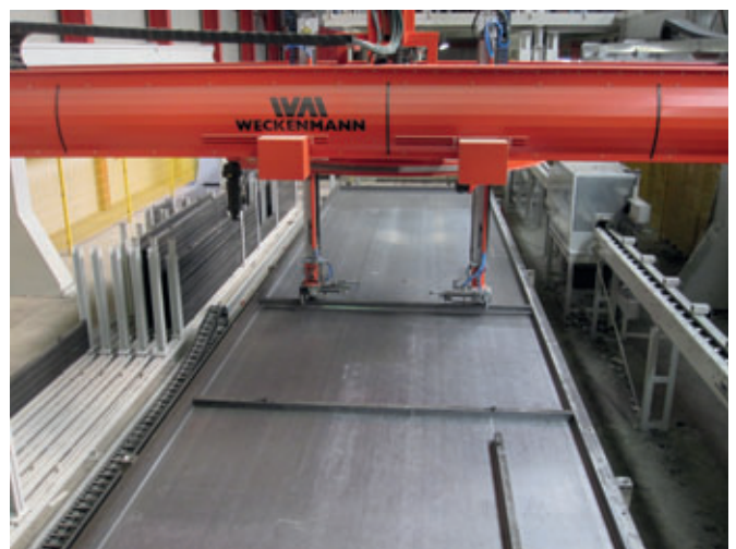
The highly efficient Weckenmann Twin-Z robot