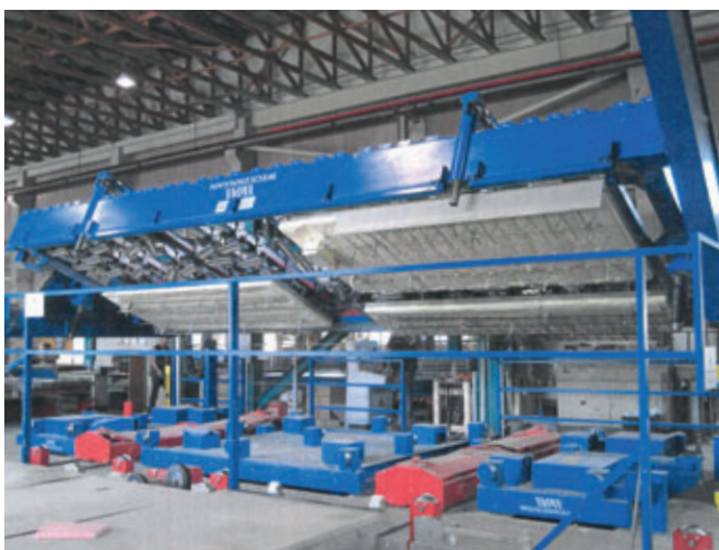
Ultra-modern suction turning technology

In all of these modernisation projects the customer's specifications are extremely demanding and testify of the high degree of trust in the machine suppliers. A good example of this is also Beton Elemente GmbH & Co. KG, based in Steisslingen on Lake Constance. In order to meet the constantly growing requirements of its customers, the company decided to modernise and optimise the existing production. The customer's requirements concentrated on the following core items: a) at least a 15 %