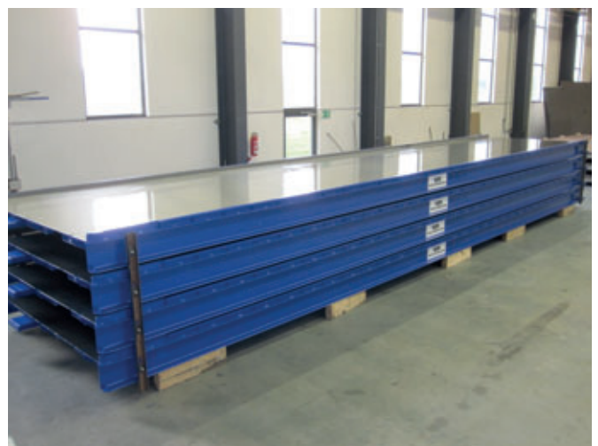
and after renovation by Weckenmann: sandblasted and free from rust and scoring.