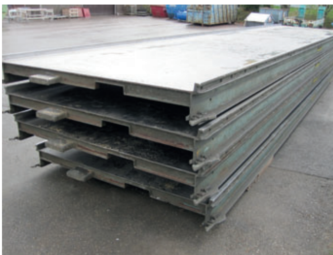
Formwork pallets before...

"In Weckenmann we have a plant supplier that can supply everything from one source and can offer the appropriate solution to every requirement."